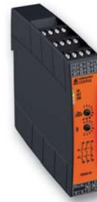
Safe sensorless standstill monitor UG 6946